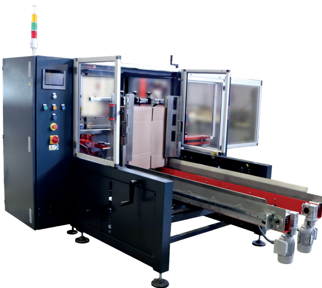
Version with motorised crate magazine

The quality and format of the boxes will be checked and approved by the technical office of IHRESS.