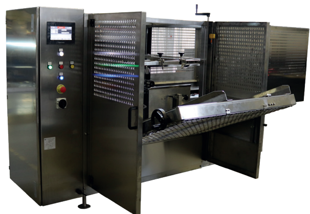
Stainless steel version