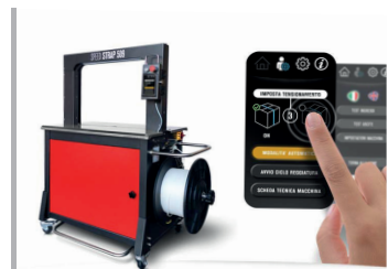
Touch screen control panel