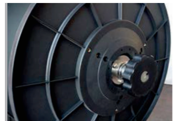
Fast strap coil change